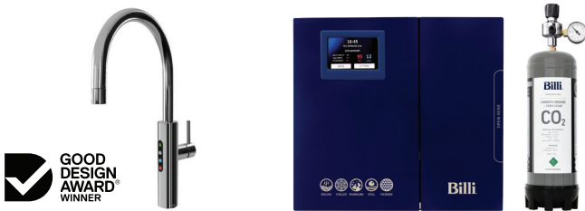
Home BCS Under-Bench Units